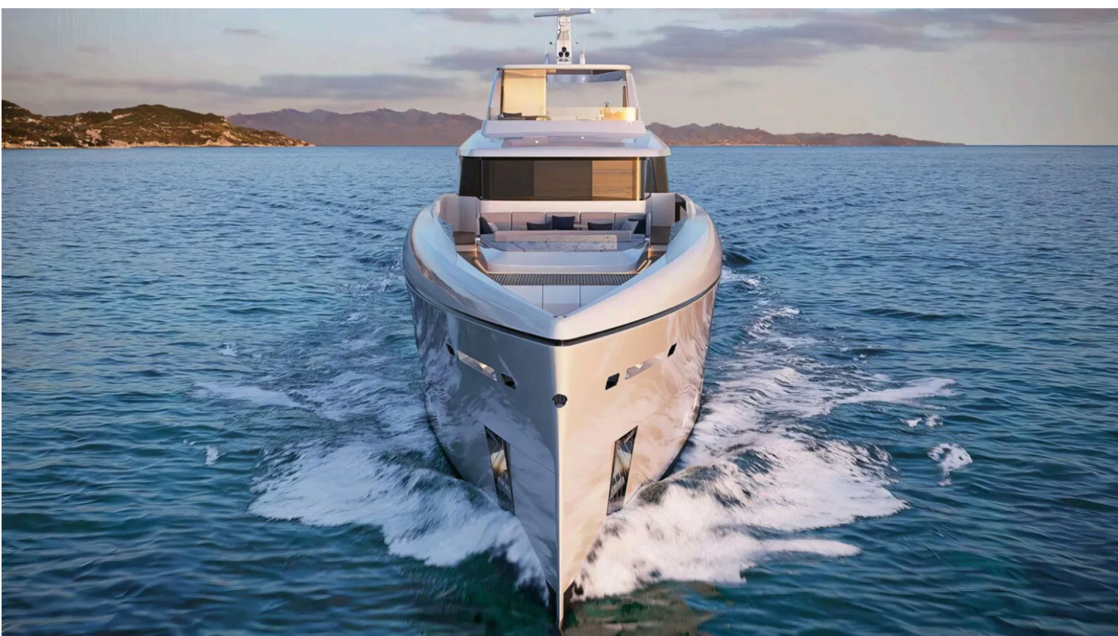
The yacht has a 8.9 metre beam

The superyacht is designed with a low draft of two metres, making it best suited to shoal draft locations such as the Bahamas, Florida and The Chesapeake.