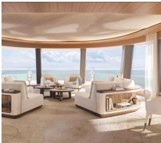
Left: the unconventional positioning of Kenshō's wheelhouse affords the upper deck with a unique living area forward