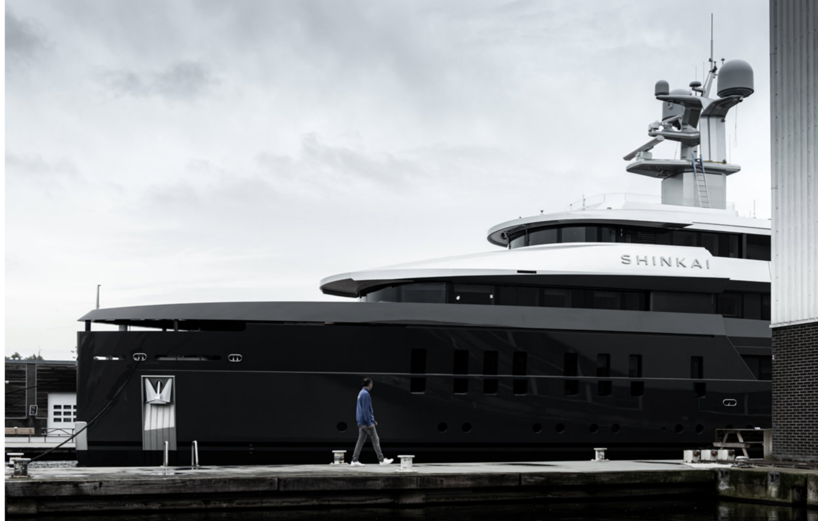
Shinkai leaving the shipyard's Aalsmeer facility